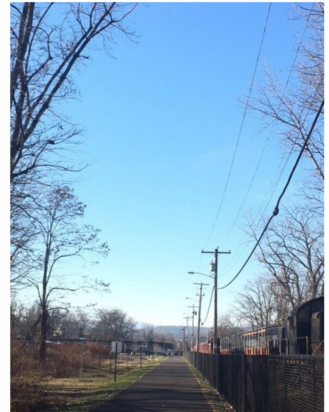
It's a paved path connecting Uptown Kingston Plaza to Midtown Cornell Street, open from dawn to dusk