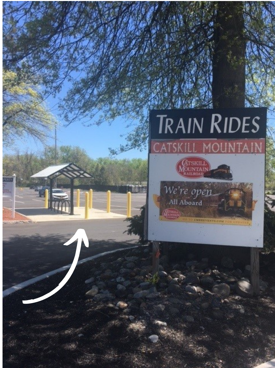
There's a bike shelter and ample parking at Hannaford's Plaza

The Linear pathways begins at Westbrook Lane and Aaron Court along the Catskill Mountain Train